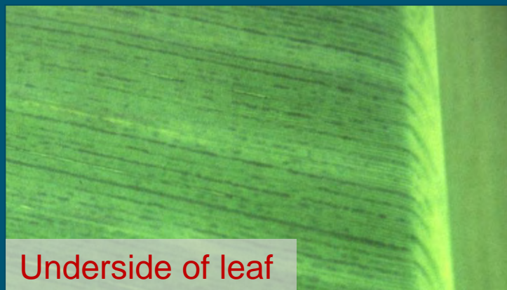
Underside of leaf

Solid bars: symptomatic Patterned bars: no symptoms